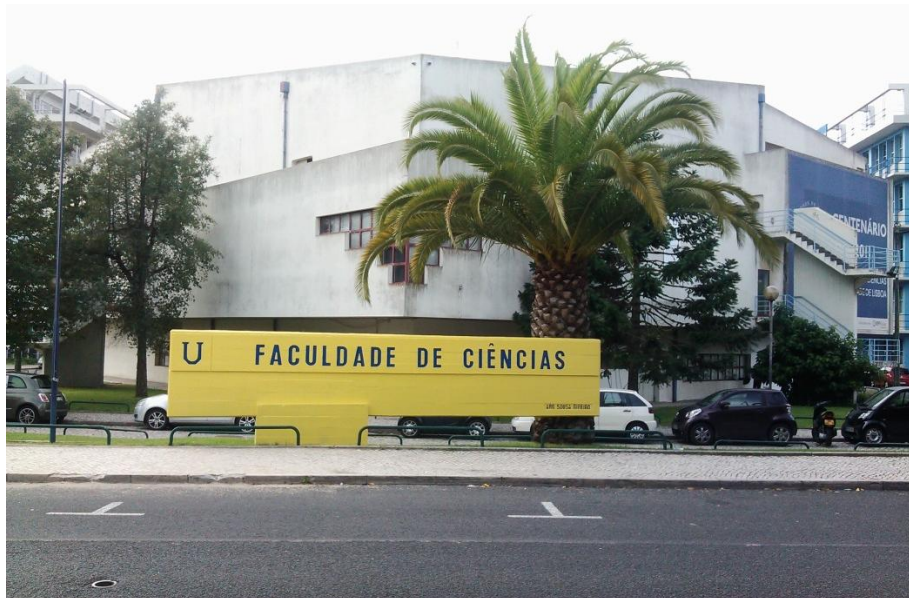
Figure 1 – Meeting point.

The meeting room is located in Building C3, Floor 1, Room 05 (3.1.05). There are several ways to reach it but the easiest way is to use yellow sign that says “Faculdade de Ciências” as a reference (Figure 1).