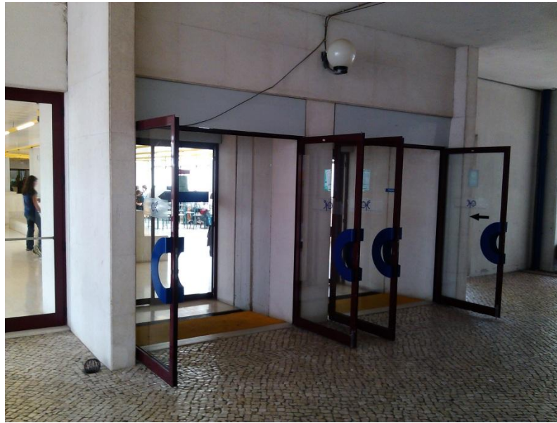
Figure 2 – Entrance of the C3 Building.